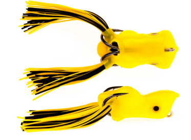
School Bus Yellow

A small, slender profile hides its true 5/16 easy casting weight. Its secret is a hefty 4/0 Owner® hook and a full round silicone skirt. For greater catching power, the hooks ride high on this popper, preventing any foldback or excess rubber getting in the way.